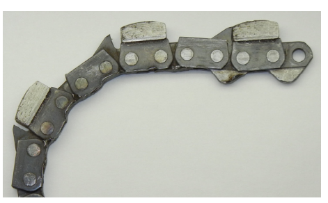
An Example of Drive Link Damage.