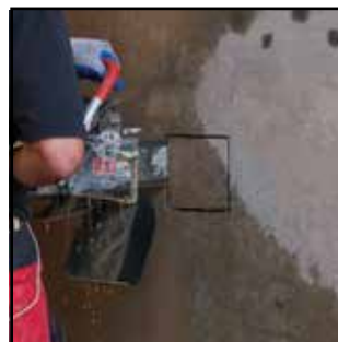
Cut squares as small as 4" x 4" (10 cm x 10 cm)