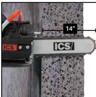
Deep cutting solution for obstructed or small openings

Extended drive sprocket adapter offers easy chain assembly