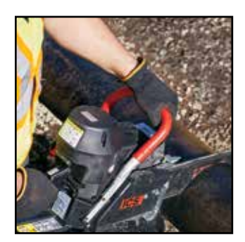
Cut up to a 10" (25cm) pipe from one side.