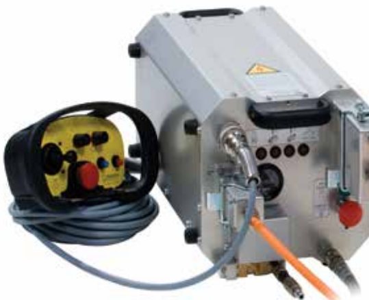
Pentpak 427 HF-power pack with Pentrunder autofeed system